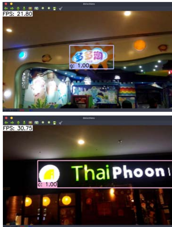
Figure 3. Testing interface.